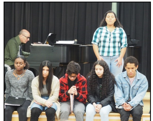
Brentwood Chamber Choir